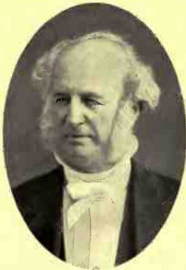
COMMODORE CORNELIUS VANDERBILT

President of the Erie Railroad in 1872. Signer of the contract with the South Improvement Company.