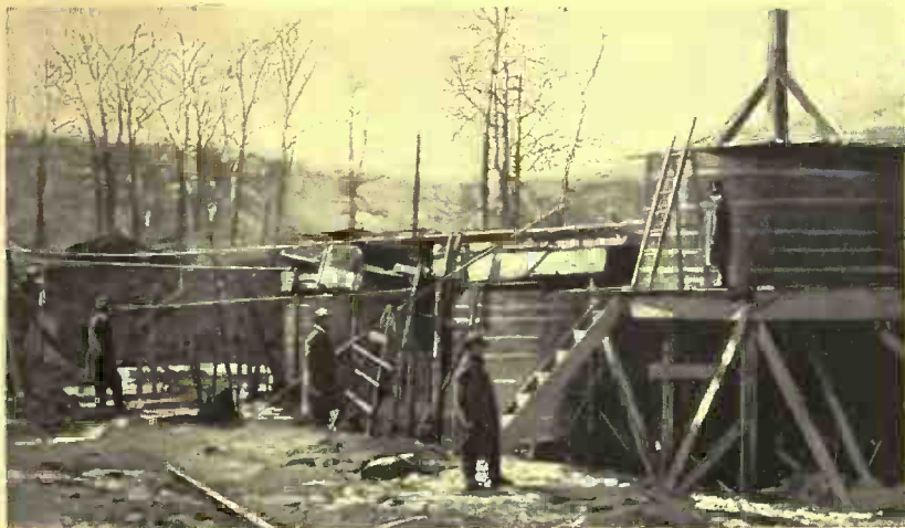
WOODEN TANKS FOR STORING OIL