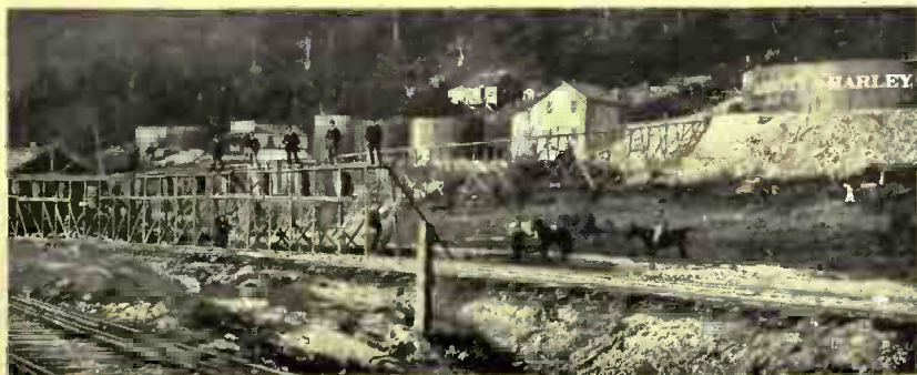
RAILROAD TERMINAL OF AN EARLY PIPE LINE