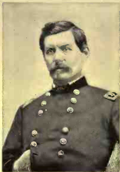
GENERAL GEORGE B. MCCLELLAN

Third vice-president of the Pennsylvania Railroad in charge of transportation when first contract was made by that road with the Standard Oil Company.