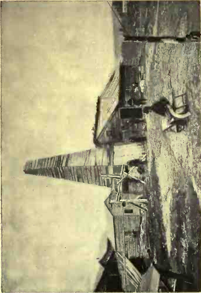
THE DRAKE WELL IN 1859—THE FIRST OIL WELL