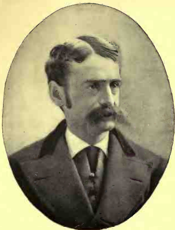
HENRY H. ROGERS IN 1872

Now President of the National Transit Company and a director of the Standard Oil Company. The opposition to the South Improvement Company among the New York refiners was led by Mr. Rogers.