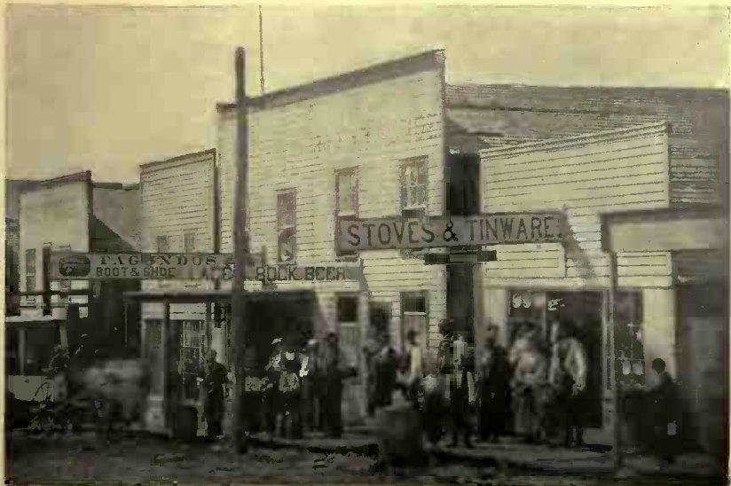
FAGUNDUS—A TYPICAL OIL TOWN