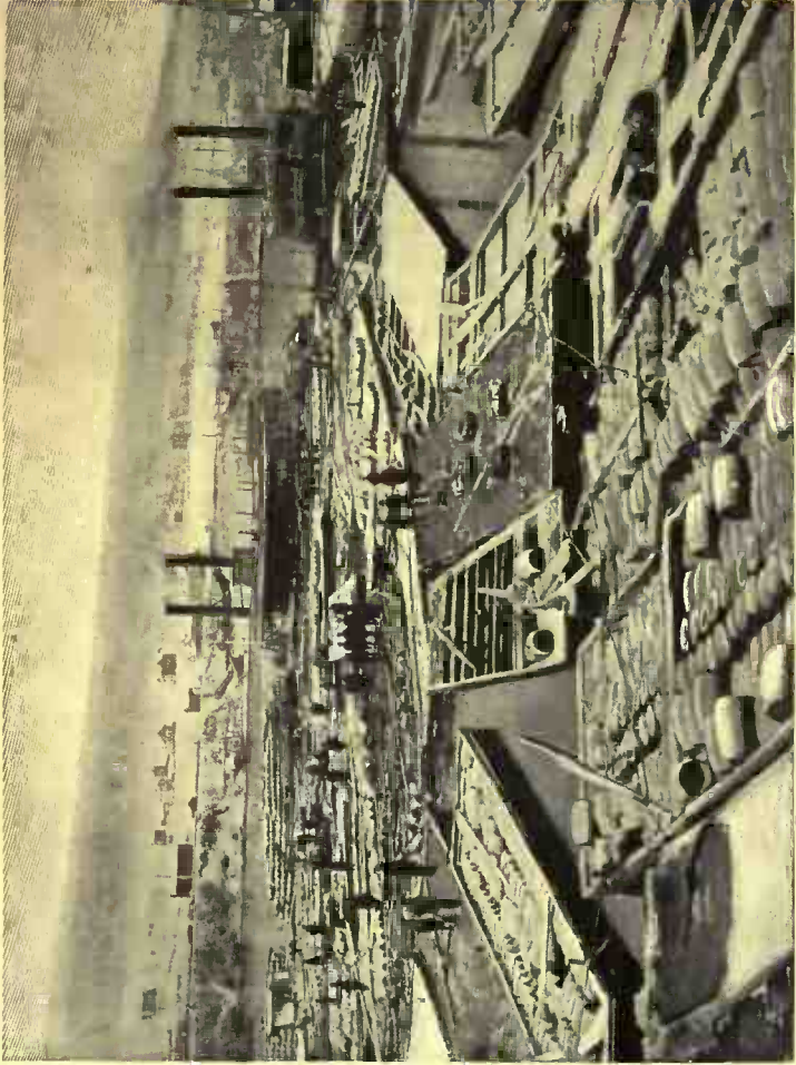
FLEET OF OIL BOATS AT OIL CITY IN 1864