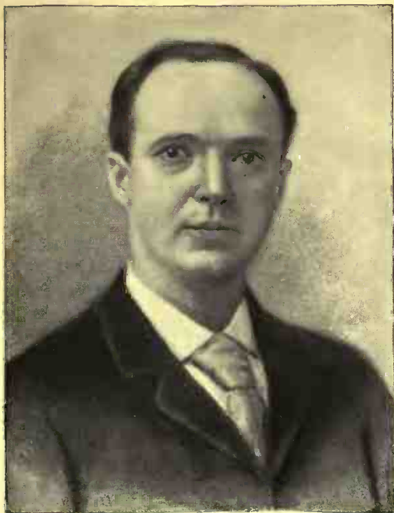
JOHN D. ARCHBOLD IN 1872

Now vice-president of the Standard Oil Company. Mr. Archbold, whose home, in 1872, was in Titusville, Pennsylvania, although one of the youngest refiners of the Creek, was one of the most active and efficient in breaking up the South Improvement Company.