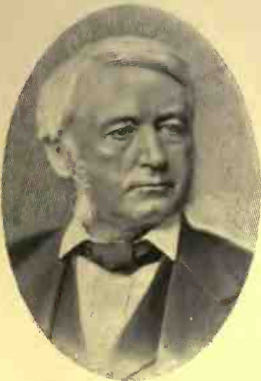
THOMAS A. SCOTT

The contract of the South Improvement Company with the Pennsylvania Railroad was signed by Mr. Scott, then vice-president of the road.