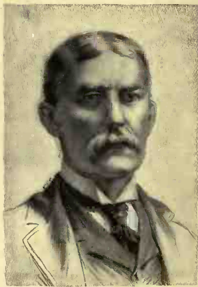
HENRY M. FLAGLER IN 1882

A member of the South Improvement Company, and later of the Standard Oil Company. At his death in 1904 the oldest living oil operator.