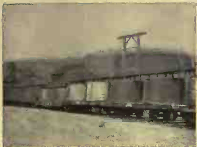
WOODEN CAR TANKS