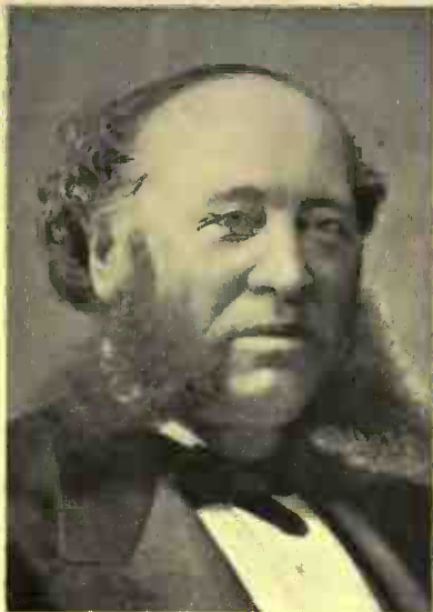
WILLIAM H. VANDERBILT

The contract of the South Improvement Company with the Pennsylvania Railroad was signed by Mr. Scott, then vice-president of the road.