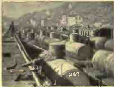
BOILER TANK CARS