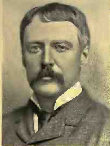
A. J. CASSATT IN 1877

Third vice-president of the Pennsylvania Railroad in charge of transportation when first contract was made by that road with the Standard Oil Company.