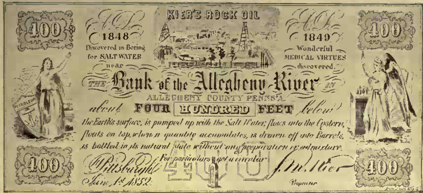
FAC-SIMILE OF A LABEL USED BY S. M. KIER IN ADVERTISING ROCK-OIL OBTAINED IN DRILLING SALT WELLS NEAR TARENTUM, PENNSYLVANIA