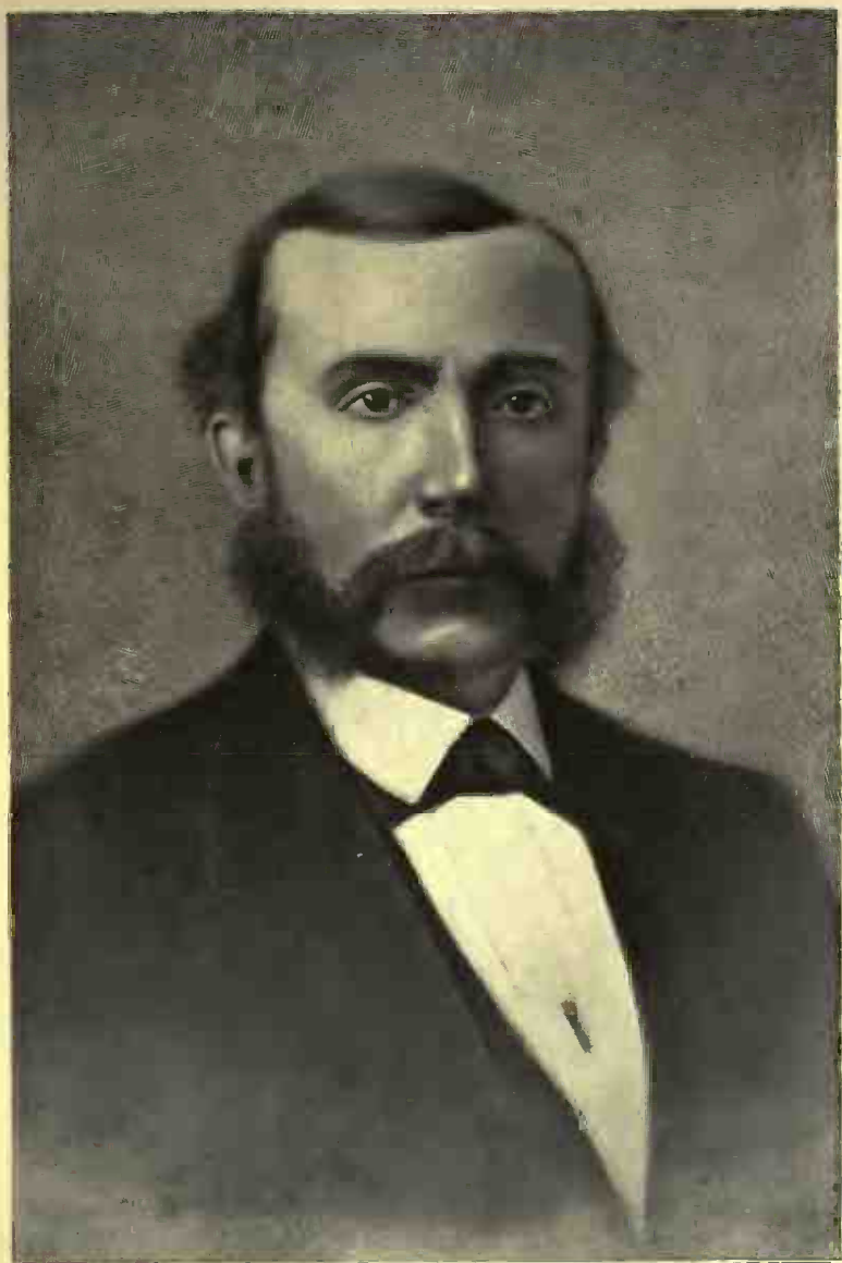
JOHN D. ROCKEFELLER IN 1872