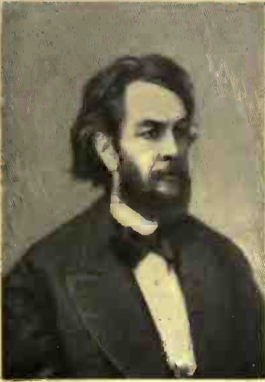
GEORGE H. BISSELL

Founder of the first oil company in the United States.